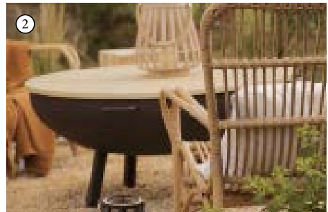
Firepit with Tabletop Inspiration Photo