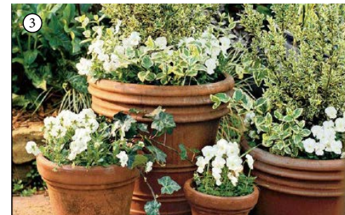
Accent Planters for Courtyard Inspiration Photo