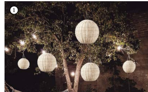
Outdoor Pendant Lighting Inspiration Photo