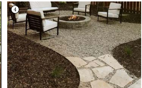
Flag Stone Entry Inspiration Photo

PROJECT: [REDACTED] CLIENT: [REDACTED] ADDRESS: [REDACTED] DRAWING: Illustrative Plan DRAWN BY: Greg K. / Sarah B. DATE: November 2020